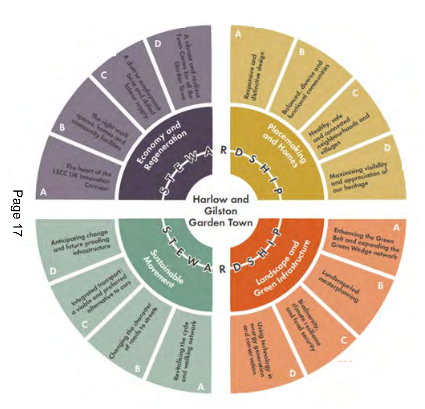
Fig 1. Relationship between the Key Principles for Healthy Growth, as set out in the HGGT Vision, November 2018.